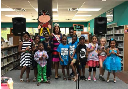
The Zula B. Wylie Public Library held its annual Talent Show in July for kids aged 18 and under. Find details about the library's summer and fall programs at cedarhilllibrary.org