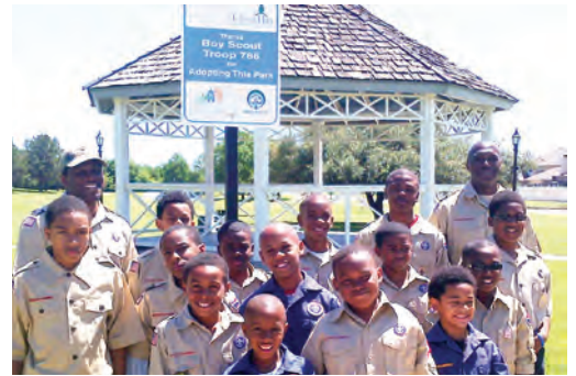
Scouts from Cedar Hill Troop 786 recently adopted Bradford Park under the City's Adopt-a-Park program.

Visit cedarhilltx.com/parks or call the Parks & Recreation Department at 972.291.5130.