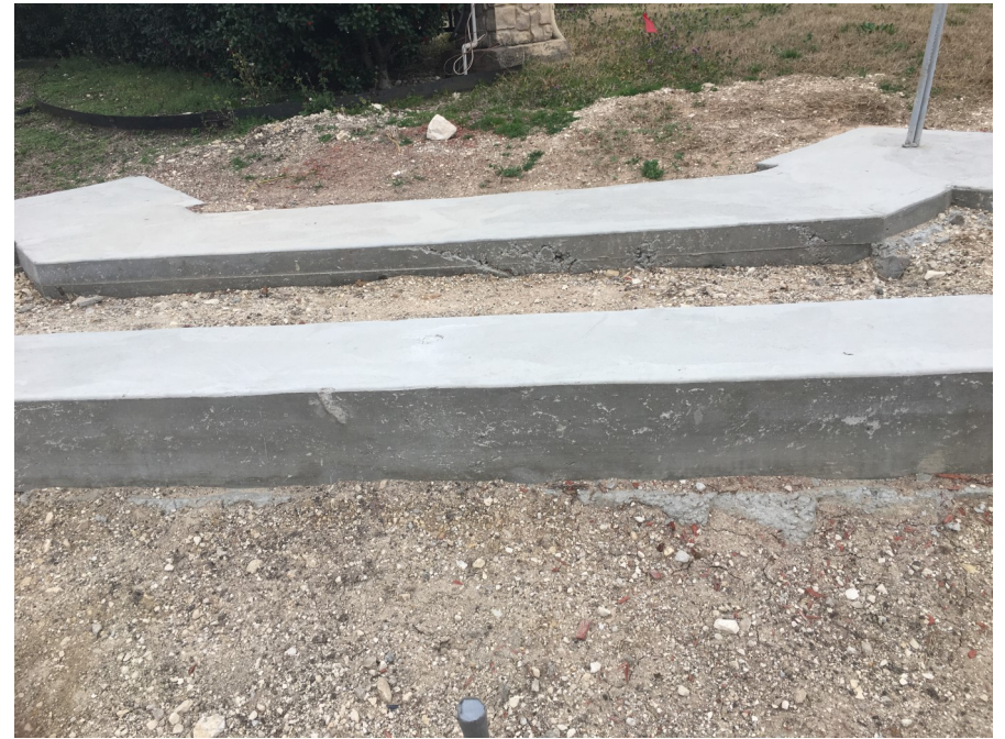
HIDDEN LAKES HOA—entrance project 2019