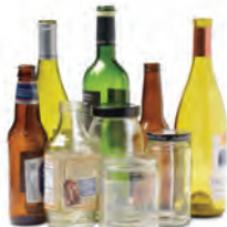
Glass bottles & jars