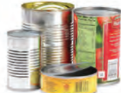
Tin & steel cans