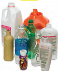
Plastic bottles & jugs