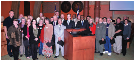
Below: A community event of this size requires a lot of effort and time from many in the community. A number of the committee heads and volunteers were present at the City Council meeting.