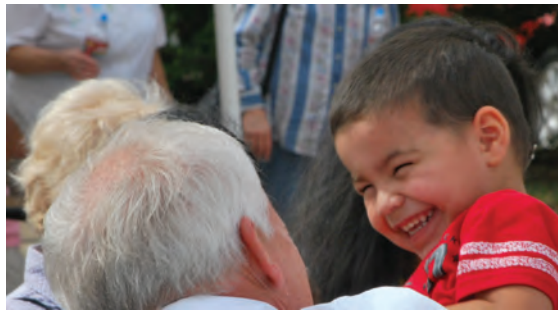
There was cute, above, doggone cute, right, and too cute, below.

Plans are already underway for Country Day 2012 on the second Saturday of October and soon the website will be updated at www.cedarhillcountryday.com .