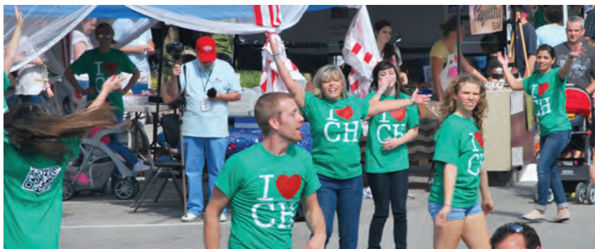
Thousands joined family, friends and neighbors for a good time.