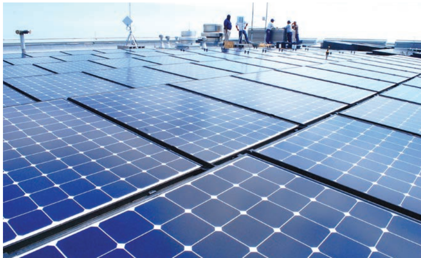
Installers finished connecting solar panels on the Government Center roof in June.

The City expects to save about $21,000 a year in electricity costs at the government Center. It will take just over a year to recover