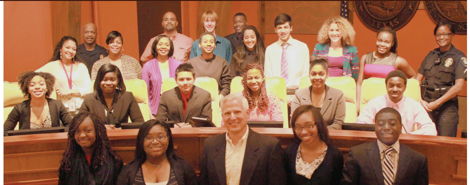
Mayor Rob Franke, front row, center, surrounded by Teen Council members, City staff and CHISD staff who participated in programs to expose students to the workings of local government.

The address is still cedarhilltx.com but now you'll find a website that is much more functional on mobile devices. Check it out.