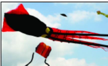
The Cedar Hill Kite Festival at Valley Ridge Park in April was a big success. Flyers had over 60 kites in the air by early afternoon. The most popular kite was the 60-foot-long black and red squid kite.