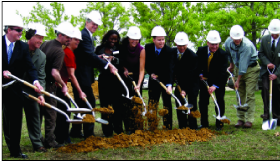
At the April groundbreaking for the 24,000 sq. ft Cedar Hill Medical Plaza at Belt Line and Waterford Oaks city officials shovel with Economic Development Corporation members and principals from Methodist Health Systems and The Cirrus Group, L.L.C. The facility is expected to open in the fall.