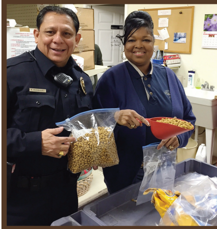
MLK Day at the Cedar Hill Food Pantry, Bridges Safehouse, the library and along South Clark Rd.