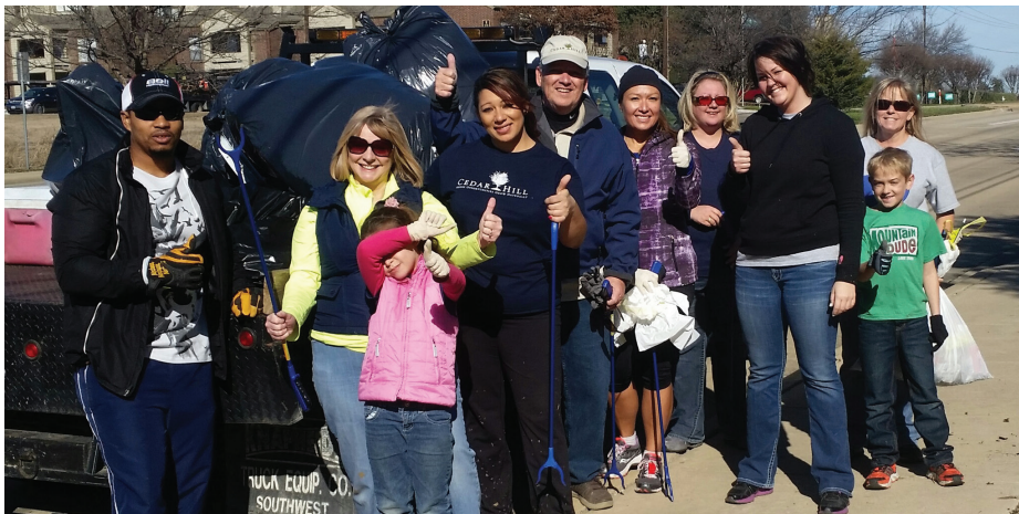
Some brought family and picked up trash in parks and along the roadside.

Below, and on the following page, are some of the ways they helped.