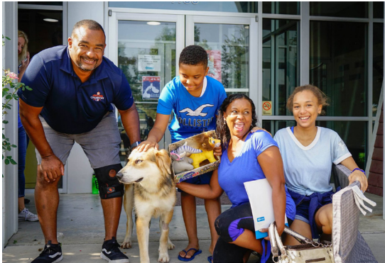
Area families added new members in August at the Tri-City Animal Shelter & Adoption Center Clear the Shelters event. Find your next furry friend at cedarhilltx.com/animalshelter .