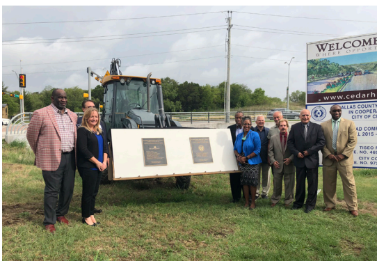
Cedar Hill City Council completes the dedication ceremony for the Mansfield Road Widening Project. For more information on this and other projects, visit cedarhilltx.com/capitalprojects .