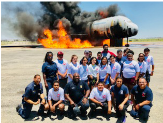
Cedar Hill teens participated in the 2nd Annual Teen Fire Academy, a weeklong program that educates teens about the fire service, career opportunities, and leadership.