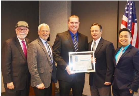
Cedar Hill was honored by Air North Texas for its outstanding sustainability initiatives, community events, and educational forums.