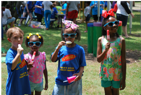
Cedar Hill kids cool off with frozen treats from Menchie's Frozen Yogurt at the Summer Reading Kickoff at the Zula B. Wylie Public Library.