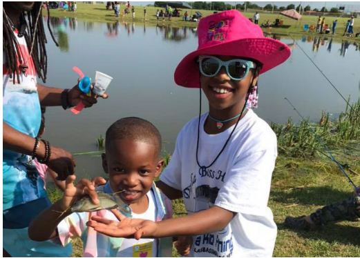
Young fishermen show off their catch at the Kid Fish Tournament held in June at Valley Ridge Park.