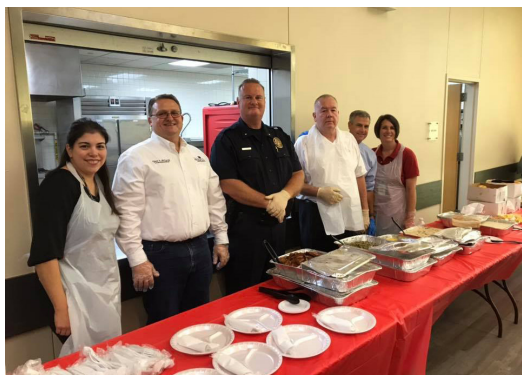
City Council and staff served lunch to seniors at the Senior Information & Wellness Expo in August.