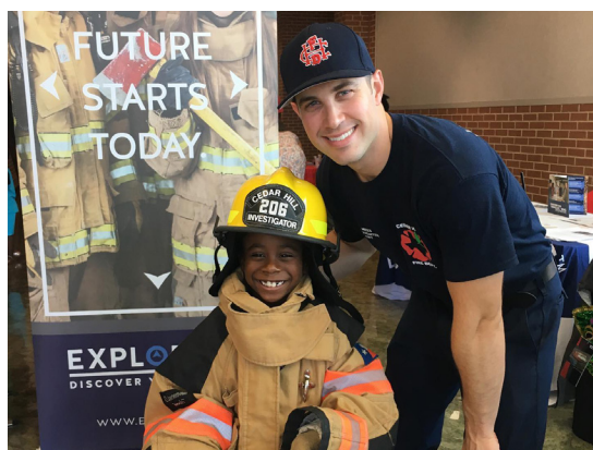
Cedar Hill Fire Department got an early start on recruiting young scholars at CHISD's annual Back to School Rally.