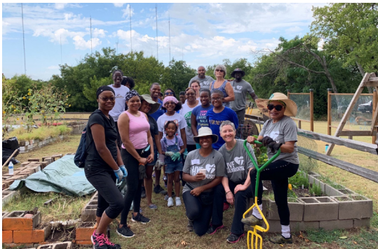
Volunteers participated in a work day at the Community Garden at the Zula B. Wylie Public Library.