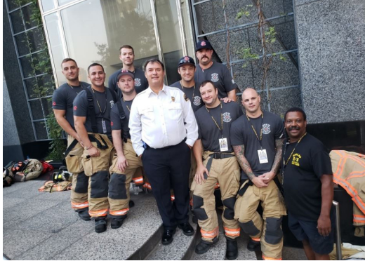
Members of the Cedar Hill Fire Department participated in the Dallas 9/11 Memorial Stair Climb in remembrance and commemoration of the first responders lost on 9/11.