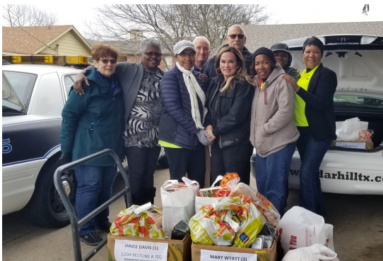
PACT Officers and Citizens on Patrol volunteers delivered Christmas meals to more than 20 Cedar Hill Food Pantry clients over the holiday season.