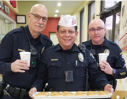
Members of the CHPD Police and Community Team (PACT) met with residents at 'Coffee with a Cop' event.