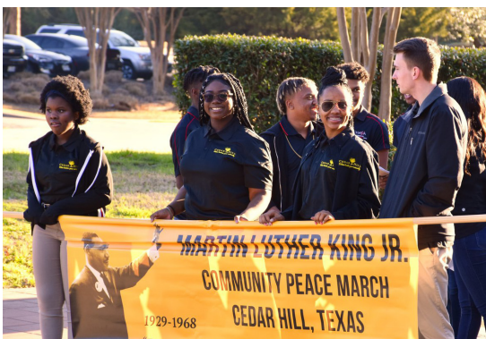
Members of the Mayor's Teen Council lead the Community Peace March in celebration of Martin Luther King, Jr. Day in Cedar Hill.