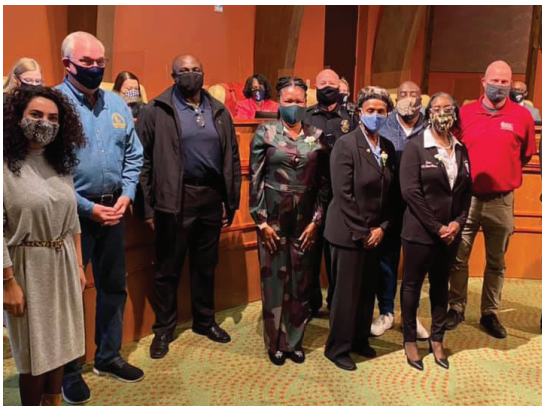
The Cedar Hill City Council honored current and former members of the Armed Services with a Veteran's Day proclamation on November 10, 2020.