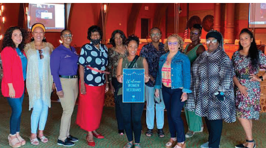
Area veterans came together for a networking mixer to honor Women Veterans Day on June 12, 2021.