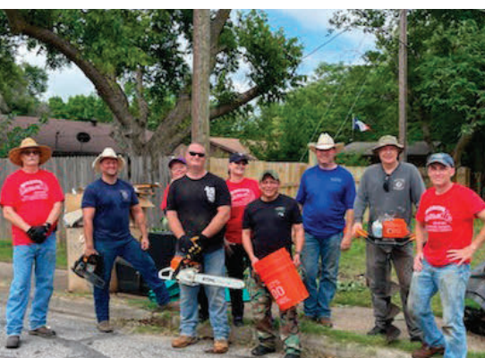
Members of the Cedar Hill Police Department volunteer for Mission Cedar Hill, an organization that assists residents with home repairs and maintenance.