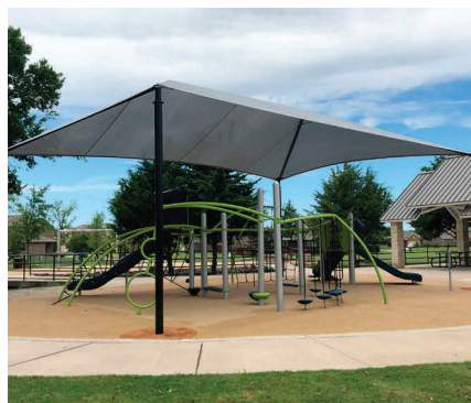
Bear Creek Park

Neighborhood park projects are funded through the 2017 bond program, when voters approved $15 million for parks improvements, including funding for reinvestment in neighborhood and community parks. Find more information on the bond programs at cedarhilltx.com/bond .