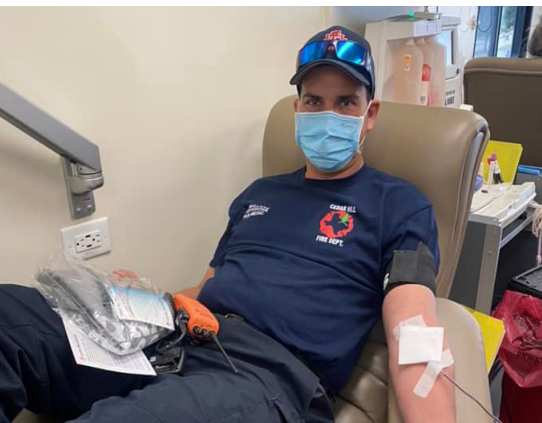
City of Cedar Hill staff and community members participated in a blood drive in January and donated more than 30 units.