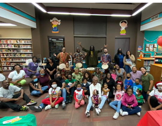
The Zula B. Wylie Public Library hosted a Kwanzaa celebration with performances, music, and traditional food.