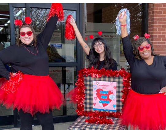
The Zula B. Wylie Public Library hosted a canned food drive for Valentine's Day.