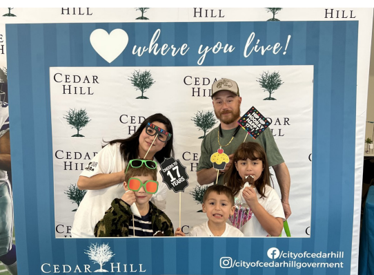
Cedar Hill families celebrated the 17 th anniversary of the Alan E. Sims Recreation Center at the citywide block party on March 5.