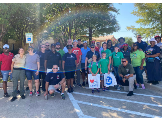
Members of the City Council and city staff joined the Cedar Hill Police Department in a neighborhood walk in Kingswood in July.