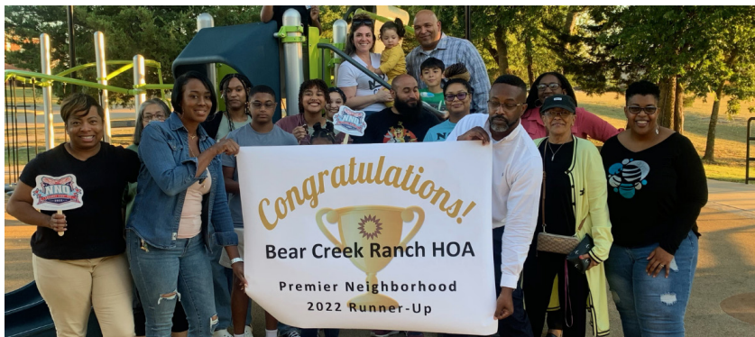
2022 Premier Neighborhood Runner-Up