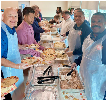
City staff and elected officials served lunch at the annual 55+ Thanksgiving event. Visit cedarhilltx.com/55 to stay up to date on events and services for seniors.