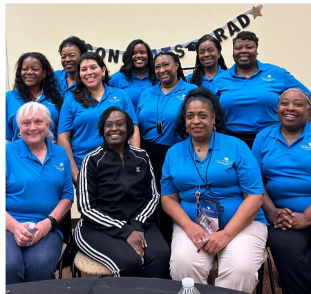
The 2022 class of the Cedar Hill Citizen Leadership Academy graduated in November. Fourteen graduates completed the six-session course that began in August.