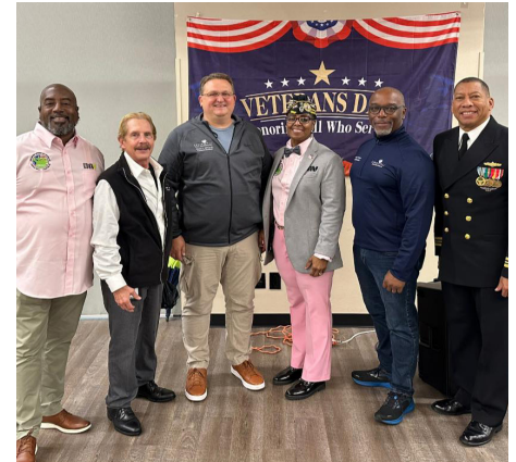
The City partnered with the local chapter of Disabled American Veterans #240 to host a Veterans Resource Fair.