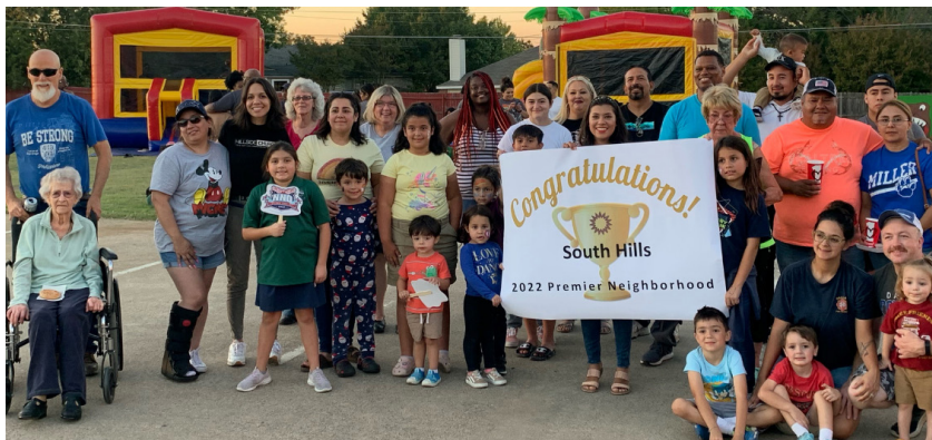
2022 Premier Neighborhood Award

Runner-Up Bear Creek Ranch goes above and beyond to host events and opportunities for their homeowners and community to give back to the City, including food drives, back to school events, and hosting a vendor fair for small businesses in their community. Their American Flag flies high and proud to show respect for the veterans and active-duty military families who reside in the community.