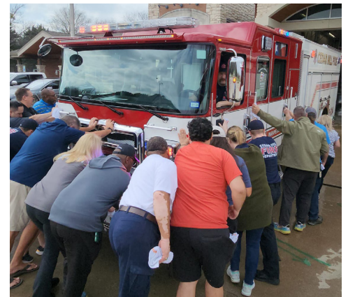
The community came together in March for a Push-In Ceremony for the new Engine 214 at the Cedar Hill Fire Department Station 214.