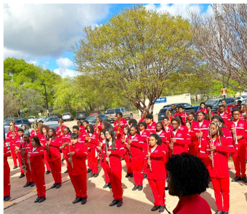
The Cedar Hill High School Marching Band performed at the ceremonial walkout of the Zula B. Wylie Public Library. The new Library, Museum and Signature Park opens this month on April 27.