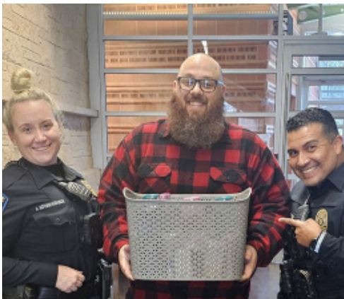
Target thanked our officers on Law Enforcement Appreciation Day with drinks and snacks to show their support.