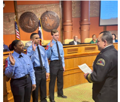
The Cedar Hill Fire Department recently celebrated a badge-pinning ceremony and swore in new hires and newly promoted fire personnel at the city council meeting.