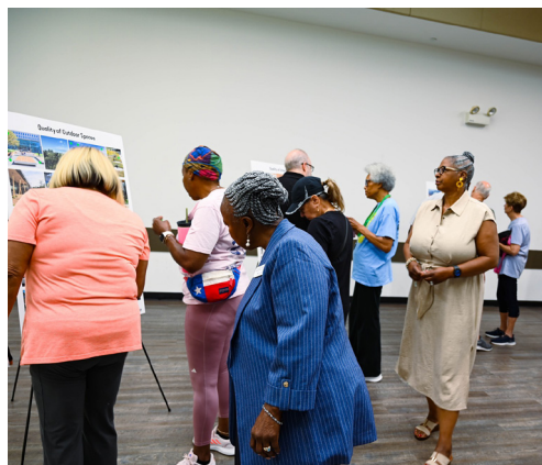
The 55+ Wing is coming to Alan E. Sims Recreation Center! Residents had a chance to share ideas and excitement for this new city development.