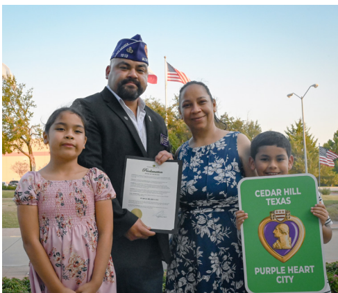
Cedar Hill is officially named a Purple Heart city! We are happy for one more way to show love to veterans and their families.