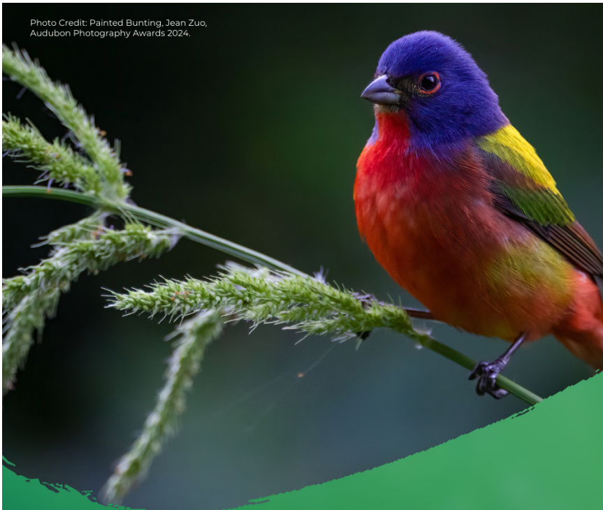
Photo Credit: Painted Bunting, Jean Zuo, Audubon Photography Awards 2024.